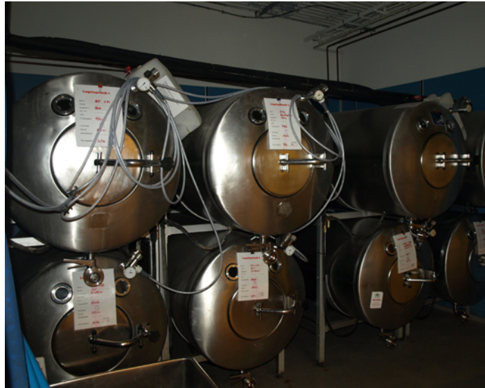
Figure 7.15 Fermentation of grape juice into wine produces \text{CO}_2 as a byproduct. Fermentation tanks have valves so that the pressure inside the tanks created by the carbon dioxide produced can be released.